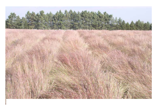
Seed production field at the Bismarck Plant Materials Center